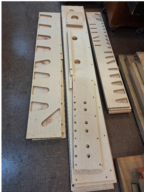
Construction of pedal chests