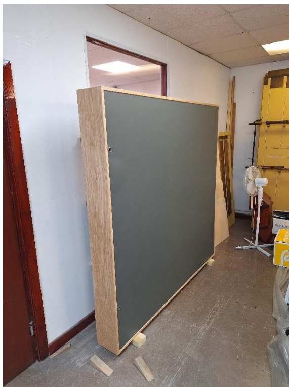
Mobile console platform