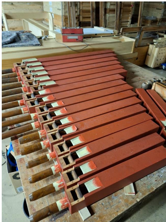
Painting wooden basses