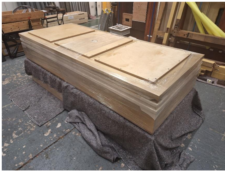
Completed reservoirs x2