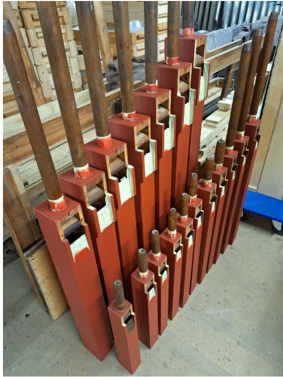
Painting wooden basses