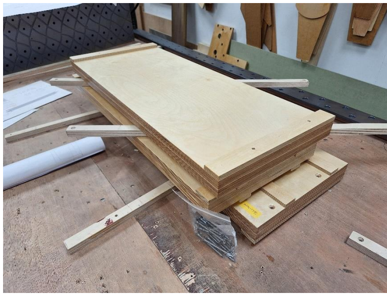
Slider solenoid brackets