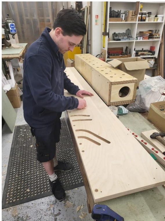
Construction of pedal chests