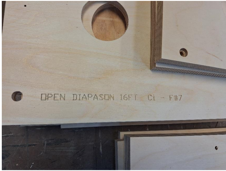
Construction of pedal chests