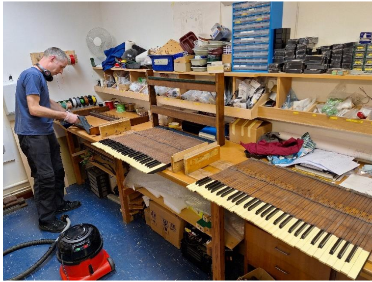
Restoration and alteration of keyboards