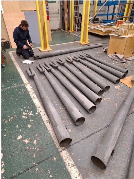
Restoring Trombone 16'