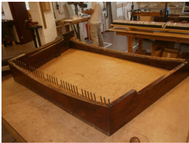
Restoring pedalboard frame