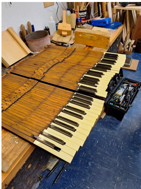
Restoration and alteration of keyboards