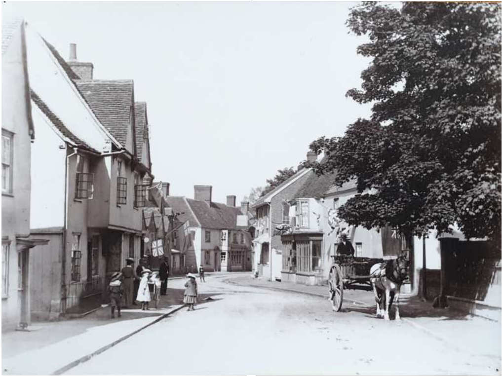
Dedham High Street in 1897. Queen Victoria's Diamond Jubilee celebration was on 22 nd June.