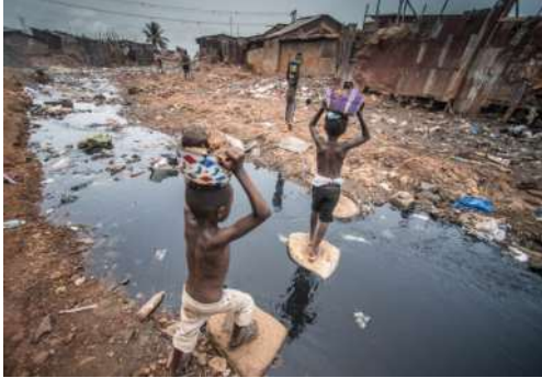
Kroo Bay area Freetown from where many of the children are from.

I recently visited Sierra Leone and witnessed an amazing scheme which supports the secondary school education of children in that country. Intelligent, determined children from desperately poor backgrounds who would not go to secondary school without help. Most of the children will go on to have fulfilling careers or to start their own businesses.