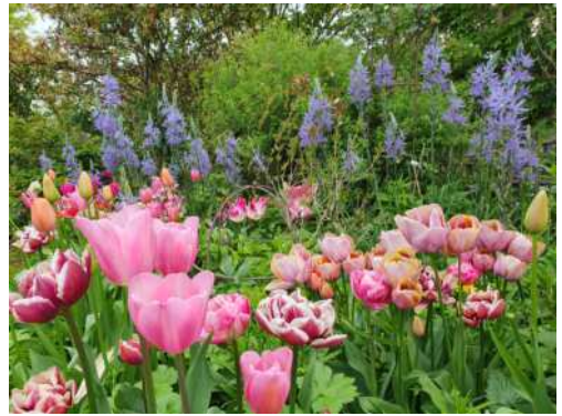
Pink Tulips and Camassia Leichtinii

Roses are peaking in every bed and border; there are spikes of richly coloured iris backed by the white racemes of wisteria, plus lilies and lupins, and alliums taking over from the last of the tulips. I've been exceptionally pleased with the display of tulips I planted late last autumn – delicate shades of pink, peach and apricot contrasted with the