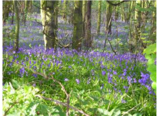
A carpet of bluebells near Langham Church.

May follows April in our calendar year and is the last month of Spring as we journey into Summer. March and April daffodils in gardens, parks and beside the roads, now give way to emerging wild flowers such as bluebells, celandines and wild orchids in our countryside.