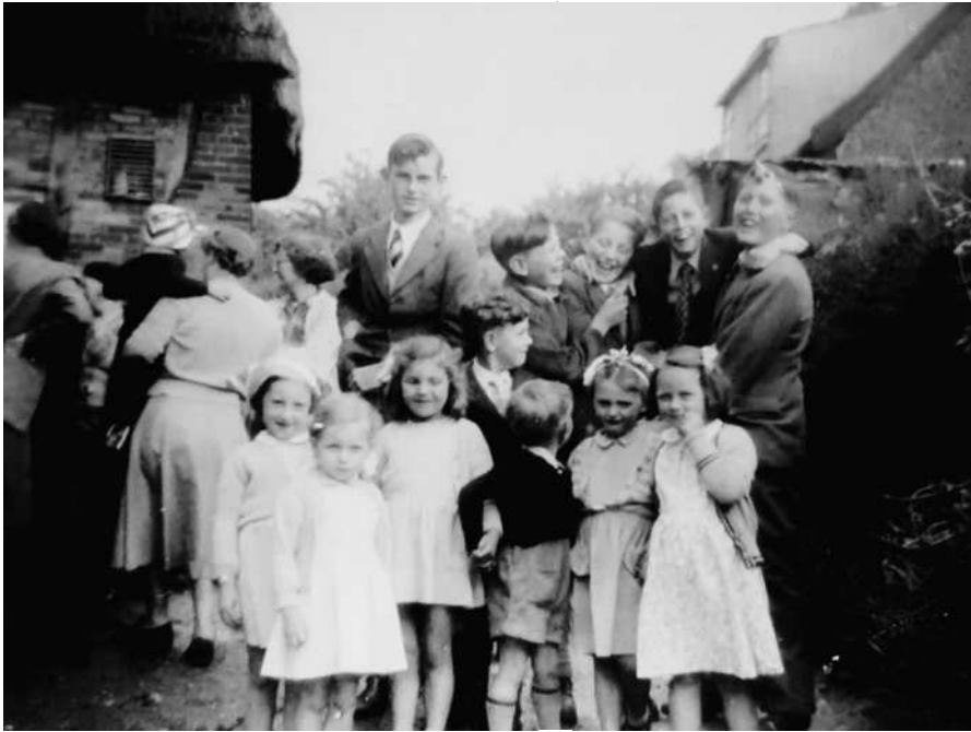
Party for Coopers Lane and East lane residents held at the 'The Old House' which was standing empty at the time.