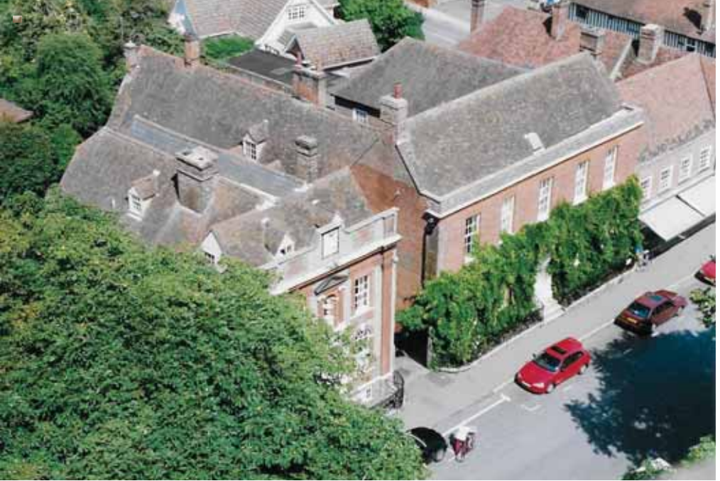
View from the church tower in 2001 showing the complex roofs of both Sherman's and Ivy House.