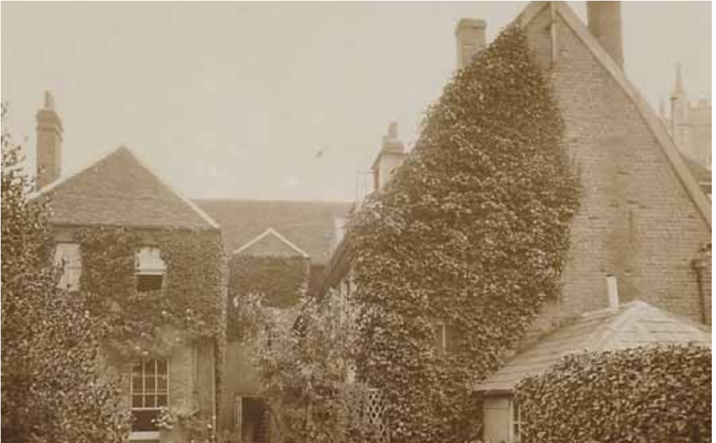
The back of Ivy House, clothed in Ivy c.1900. On the left is the addition built in the mid eighteenth century; on the right the older timber-framed wing which is now Ivy side Cottage.