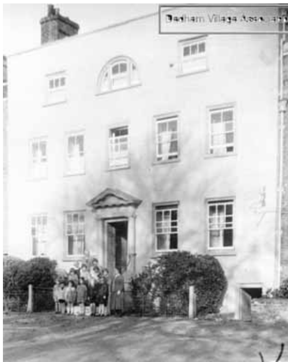
The school at Gould House in the 1930s.