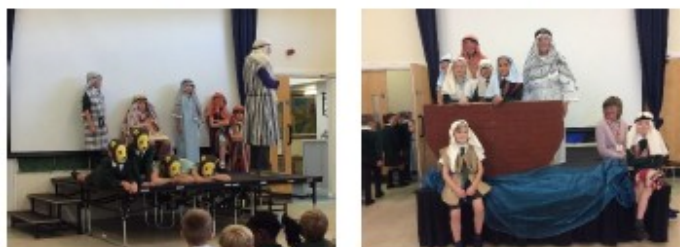
Open the Book assemblies