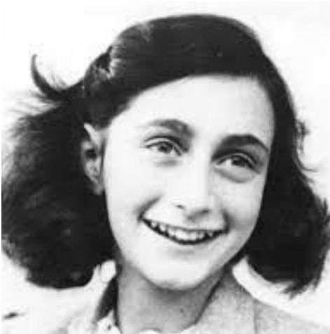
Diary of Ann Frank: 1 April