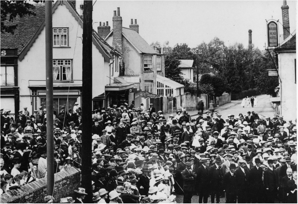
In this view of the Dedication of the War Memorial in 1921 one can see the house with a glazed front porch which was to become the East Anglian School of Painting and Drawing in 1937

school building on 26 July 1939, only two years after it had opened. Attributed at the time to an electrical fault, the fire which engulfed the house that night may well have been started by an unextinguished cigarette, accidentally left burning after he and another student had been working late the evening before. No one was hurt. The only person who slept in the building was the School's Chinese model who jumped twenty feet to safety.