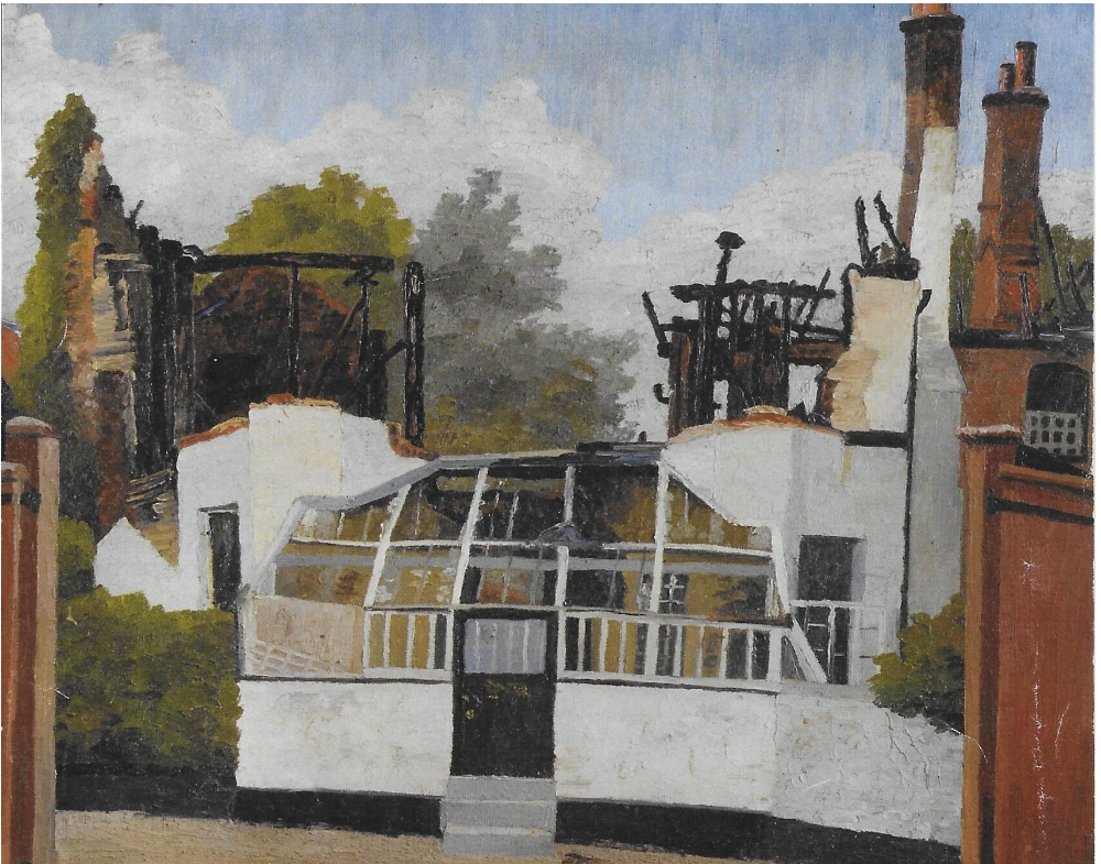
Cedric Morris's painting of the burnt-out Art School the morning after the fire in July 1939