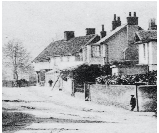
The house in Mill Lane between the Essex Rose tea room and Octagon House, as it appeared in the early 20th century before it became the East Anglian School of Painting and Drawing

seventeen in the early summer of 1939 believed that he may have been responsible for the destruction of the