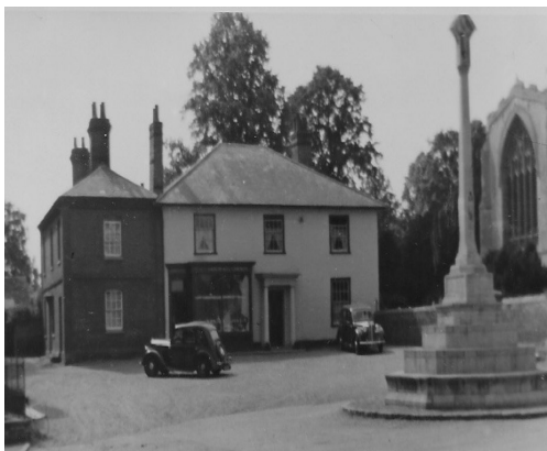
Gooch's Chemist in Royal Square in the late 1940s