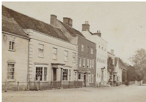
Loom House (then Church House) in the 1880s, showing its original bay windows