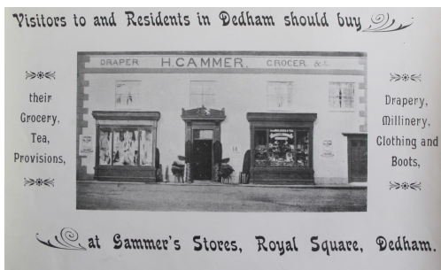
Henry Gammer's new shopfront, probably dating from 1994