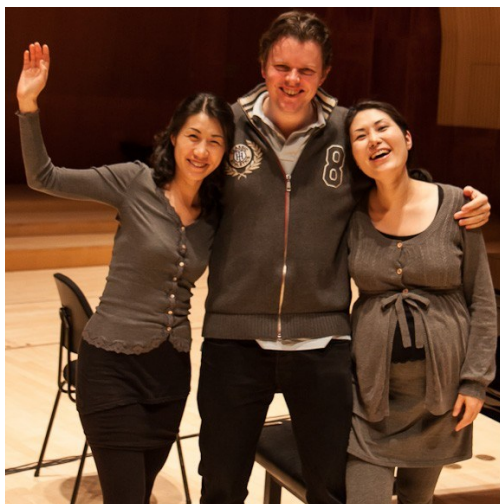
Trio Con Brio Copenhagen – 10 Nov

Trio con Brio Copenhagen , Stour Valley Arts and Music at East Bergholt Church, 4pm.