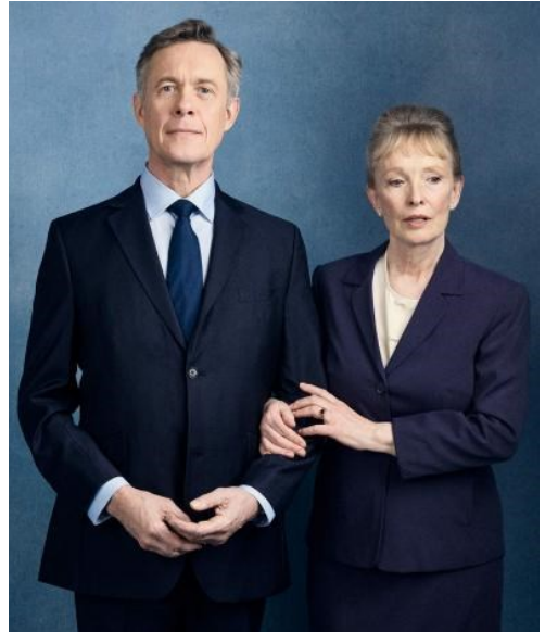
Hansard from the National Theatre,

Hansard by Simon Wood, National Theatre - LL at Lakeside Theatre,