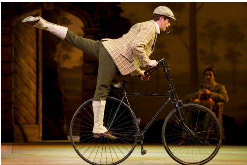
Enigma Variations , from The Royal Ballet 5 Nov

Miscarriages of Justice I have known, Stour Valley Arts and Music at Dedham Assembly Rooms, 5pm.