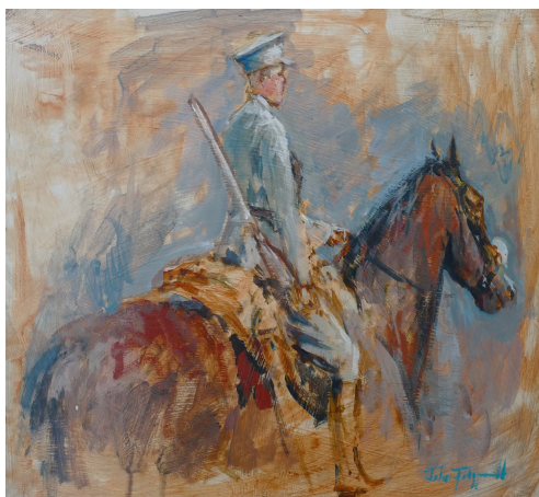
Study-Camp Life

Munnings's own paintings, and the special exhibition of his war paintings, "Behind the Lines", demonstrate his