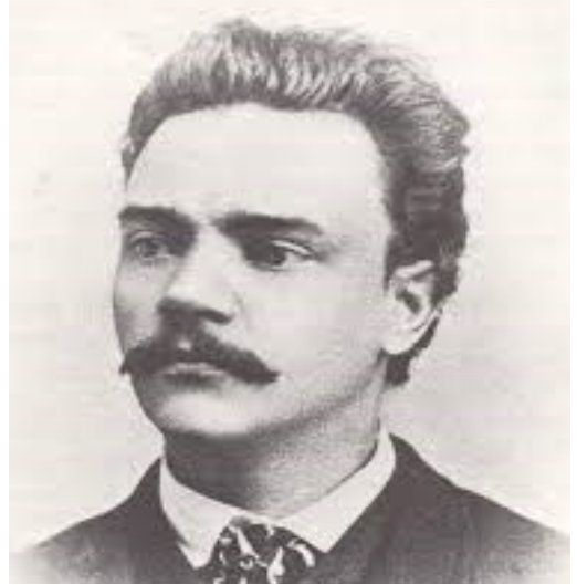
Antonin Dvorak: Stabat Mater, 30 March

Dvorak: Stabat Mater , Stour Choral Society, 2.30pm at Mistley Church.