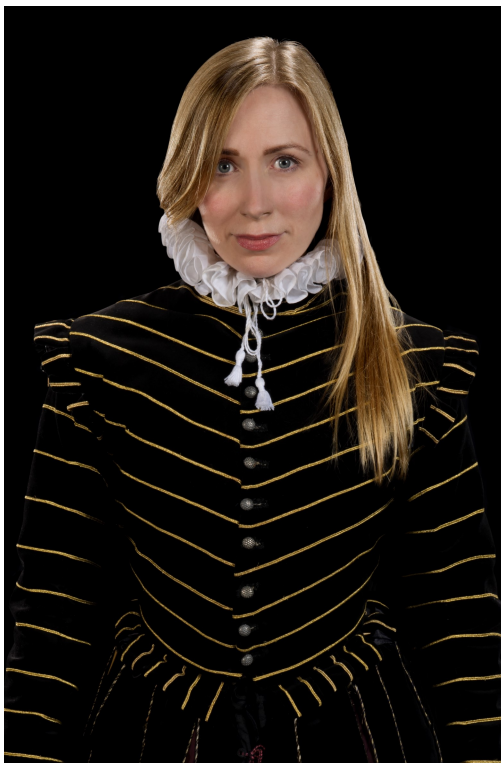
Orlando 14 March

Medea Electronica , a re-telling of the Greek tragedy, Lakeside Theatre, Colchester, 7.30pm.