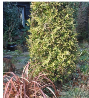
Thuja , Phormium 'Jester' and Festuca glauca 'Blue Glow' in a shady border

Like evergreen shrubs, many conifers create their own permanent 'rain shadow', so 'raising the canopy' will enable rain and fertilizer to permeate the dry ground. But remember, conifers don't always take kindly to heavy pruning and not all