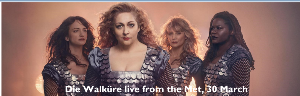
Die Walküre live from the Met, 30 March

Mozart and Mahler , Colchester Symphony Orchestra, 7.30pm at St Botolph's.