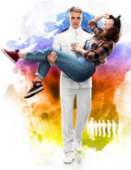
An officer and a Gentleman 27 Aug

An Officer and a Gentleman , a new musical, Regent Theatre Ipswich 7.30pm, .