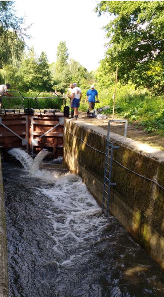
Filling up: the restored lock at Stratford St Mary

fields. (Probably best not to contemplate the lack of hygiene in transporting grain and human or horse waste in the same vessel.)