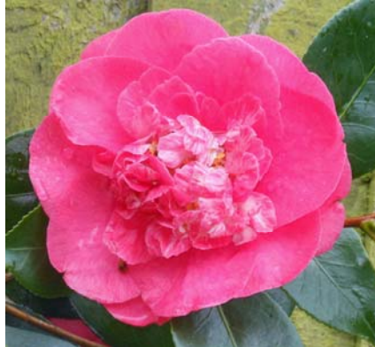
Camellia R.L. Wheeler

both sides of the label so if one side fades, the reverse should be OK. This simple idea is your gardening tip for this month. But an even worse problem that comes with age is the inability to conjure up a plant's name when confronted with a blank label and no identifying foliage. This is where the Great List comes to the rescue. Everything (well more or less) is recorded on the computer (in Word ). Using Ctrl+F and adding a key word may give the answer, or reading through the list till the name jumps out works