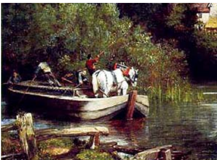
White Horse on the Stour: Constable