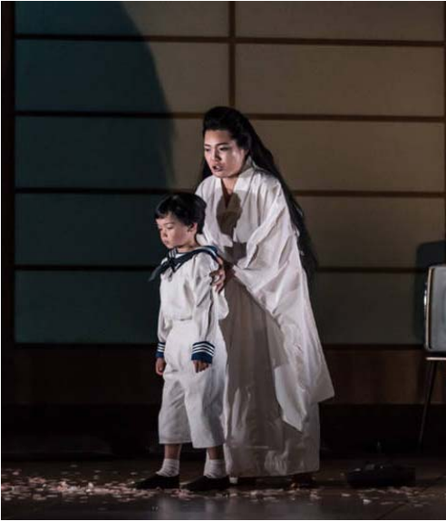
Puccini's Madame Butterfly live link from Glyndebourne, 21 June