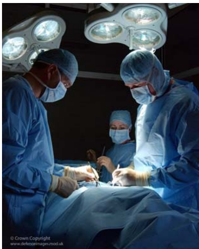
Specialised treatment: choice might be reduced

Ardleigh Surgery ☎230 224 Dedham ☎322 290 www.ardleighsurgery.nhs.uk