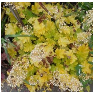
Heuchera 'Lime Rickey'

Unlike the usual green variety, the smaller shrub Skimmia 'Magic Marlot' with pink flowers (pale green and cream leaves) is a firm favourite even though it is slow growing, and if you want a perfumed evergreen you need Daphne in your border ( alias Daphne odorata ). If you can get 'Margery Postil' she's the