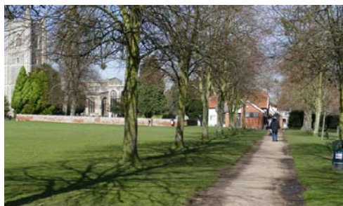
The Drift: one of the council's projects

We would welcome views from residents, local organisations and our businesses on any of the above proposals and of course if one or other of these does not go ahead we would be seeking an alternative project to fund that would also benefit the whole community. In this regard I also invite you to