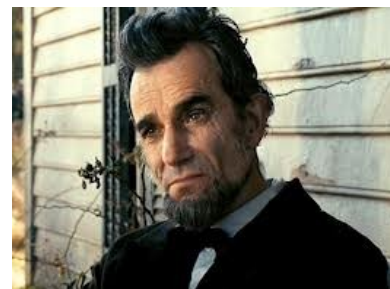
Daniels Day Lewis in the film Lincoln