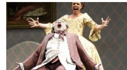
Don Pasquale . from the 2011 Glyndebourne tour

❖ Tue 6 Aug: 7.15 pm Glyndebourne Music - live link: Don Pasquale by Donizetti, firstsite, Col-