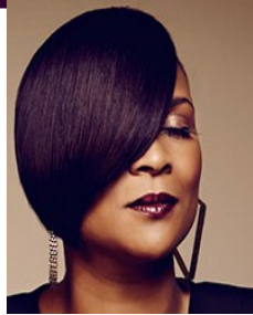
Gabrielle: 15 Aug