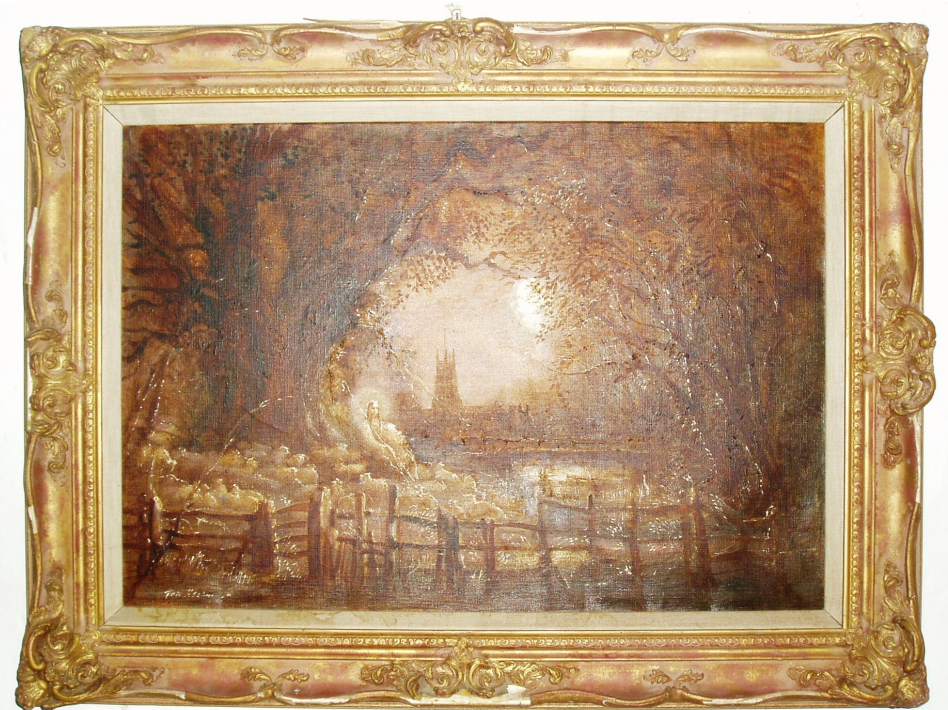
The painting, 'for my friends in Dedham' hangs in the Muniment Library in the Parish Church.