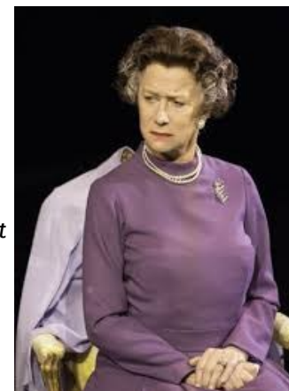
Helen Mirren as The Queen 13 Jun