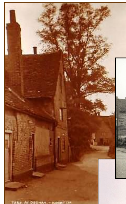
Above and Right c.1945