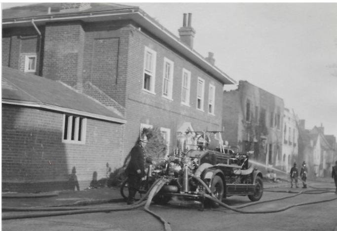
Westgate House and Great House, High Street, 1 Dec 1936

Little House to the east, which shared a party wall, was extensively damaged but was not beyond repair. Great House had been completely gutted. The brick façade was still standing after the fire had been put out but it was in such a precarious state that it had to be demolished immediately.