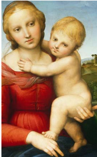
L'Enfance du Christ by Berlioz, 10 Dec

Suffolk Villages Festival: Charpentier's Messe de Minuit .