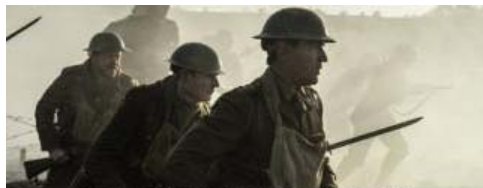
ARE YOU A VICTIM TO OPTIMISM?

❖ Sat 12 Nov: Lexden Choral Society; St Botolph's Colchester. 7.30 pm Bury Bach Choir: Mozart's Requiem ; The Apex Bury. 7.30 pm Ipswich Chamber Music Society: Isim-siz Piano Trio; Ipswich School.