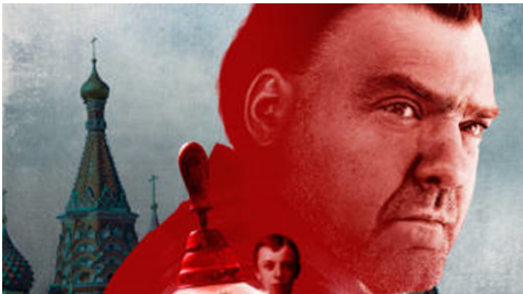
Bryn Terfel as Boris Godunov

❖ Sat 5 Mar: 5.55 pm Metropolitan Opera New York - live link: Puccini's Manon Lescault ; Firstsite, ❖ Fri 11 -12 Mar: 7.45 pm : Platform Musicals: Harold Fraser Simson's The Maid of the Mountains ; The Headgate, Colchester. ❖ Mon 21 Mar: 7.15 pm Royal