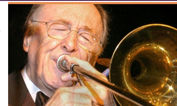
Chris Barber - 5 Aug

♦ Fri 5 Aug: Chris Barber and his band - jazz.